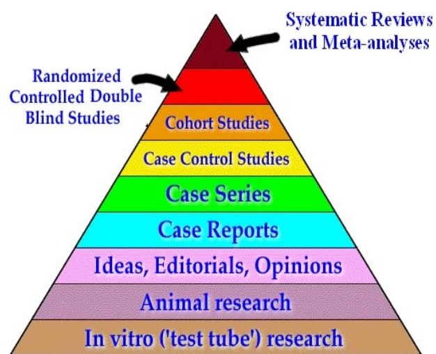
Fig.1 Evidence Pyramid(Quoted from http://library.luhs.org/Guides/epbguide/EBMPyramid.htm )

And, the McGill Consensus Statement in 2002 4 as well as the supporting literatures 7,8 report that dental implant supported overdenture is more excellent than complete denture in a sense of treatment modality. But depending on patient’s condition, every patient cannot simply accept dental implant placement. So in the course of determining whether or not patient really needs implant placement, the question “what kind of complete denture can be accepted by patient” would be growing its worldwide importance.