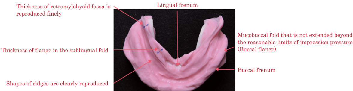
Fig.16 Check of Impression body

the reasonable limits of impression pressure