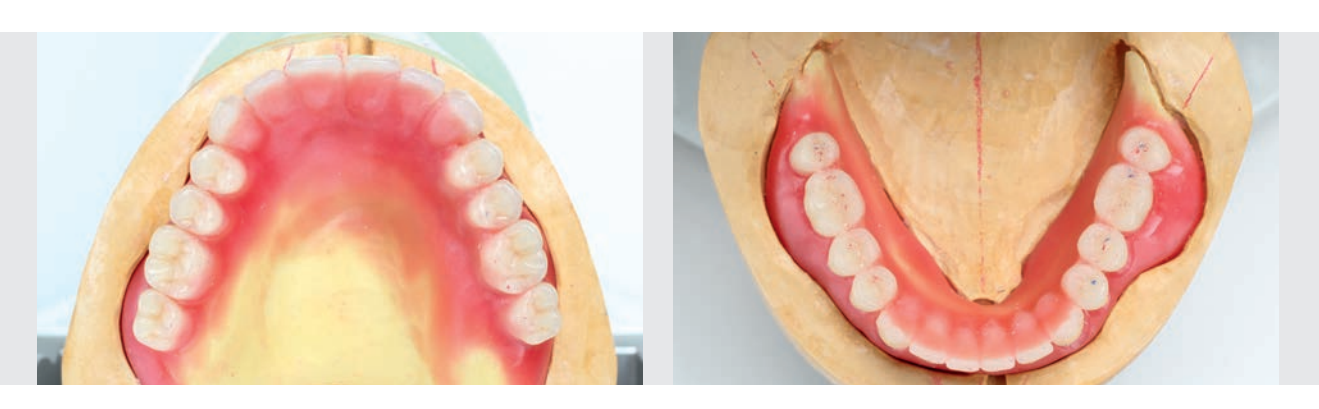
Fig. 6: Setting up the maxilla: the premolars are positioned closely to the alveolar crest.

Designed for classic occlusal schemes, the SR Phonares® II moulds are ideally suited for complete dentures. The facial meter (alameter) integrated into the SR Phonares II FormSelector assisted in selecting the moulds that were best suited for our patient. The teeth were set up in line with the set-up criteria for the classic occlusion. To prevent the flabby ridge from allowing the denture to move, the upper premolars were positioned close to the centre of the alveolar ridge (Fig. 6). We decided to place premolars in the dorsal area of the mandibular arch to achieve an external seal with the buccal mucous membrane and the lingual wall at closed mouth position (Fig. 7). The requirements of function and stability and patient specific characteristics were considered in the tooth set-up. The patient was in the habit of chewing food with her anterior teeth because of her Angle Class III malocclusion. This should be avoided in the new dentures by providing enough freeway space between the anterior upper and lower teeth at the set-up. A great deal of attention was