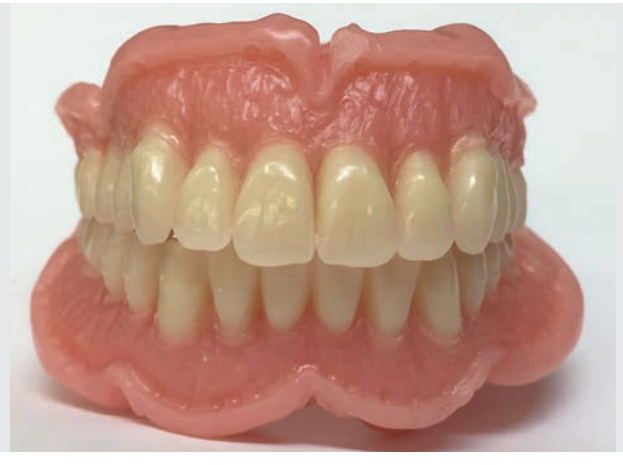
Fig. 9: Dentures prior to soft tissue customization