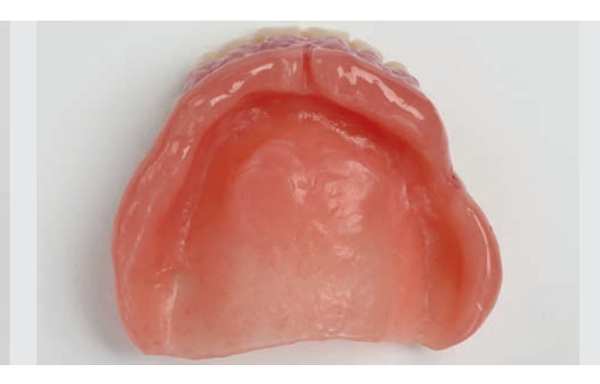
Fig. 12: View from the reverse side: the broad functional margin in the labial vestibule prevents the denture from shifting.