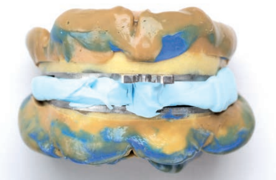
Fig. 5: Customized impression tray and registration device form a unit.

The Angle Class III malocclusion can be clearly seen on the articulated models (Fig. 4).