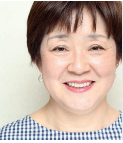
Fig. 13: Customized denture in situ: It's hardly noticeable that the patient is wearing conventional full dentures.